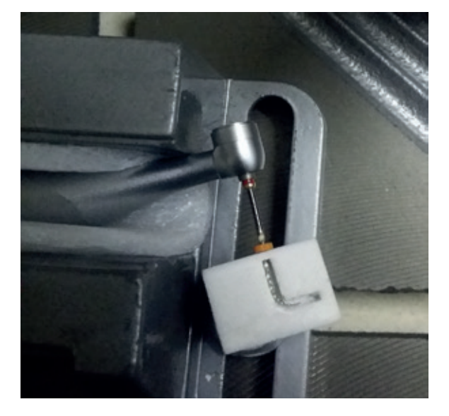
Figure 1 Device created for the cyclic fatigue resistance tests of the rotary instruments.