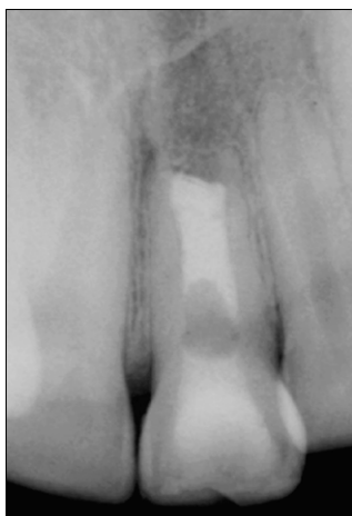
Figure 3. Radiographic image at the 3-year follow-up, showing the complete healing of apical periodontitis.

ly, even it is not a common event, in persistent root canal infections, the existence of a foreign body should be suspected. The apical periodontal tissues can encapsulate a foreign object and an intense inflammatory response characterized by the abundance of macrophages and giant cells and a subsequent foreign body reaction can be developed (18). Furthermore, if a patient has a record of emergency assistance, with incision and drainage procedures, the risk of drain displacement in the periapical tissue due to improper suturing must be strongly considered. Being aware of this possibility aids in avoiding the erroneous diagnosis of periapical granulomas and repeated changes of intracanal medication (24). In this clinical report, after numerous dental appointments, in which conventional apexification was considerate, the apical surgery was assumed to be the treatment of choice, due to persistent infection and acute events. Apical surgery is a procedure aimed at diagnosing and treating endodontic lesions (apical periodontitis) that are not responsive of or do not improve with conventional endodontic procedures (27). Success rates for endodontic microsurgery have been reported to be between 88.9% and 100% (28), and these high levels of healing corroborated with the successful treatment reported in this article. Apical surgery has advanced to become a modern technique which has good results with regard to treatment of endodontic lesions with predictable healing patterns (29).