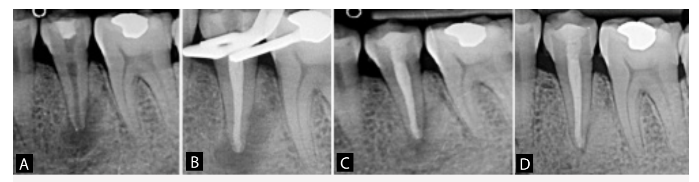
Figure4 A) In intraoral periapical radiograph showing tooth 35 with large peri-apical lesion with an open apex. B) Completion on tooth 35 root canal filling using OrthoMTA. C) Three months follow up radiograph showing tooth 35 with complete resolution of the periapical lesion. D) Thirty months follow up radiograph tooth 35 showing satisfactory healing.

sis with symptomatic apical periodontitis was made and root canal therapy with the management of open apex using OrthoMTA was advised.