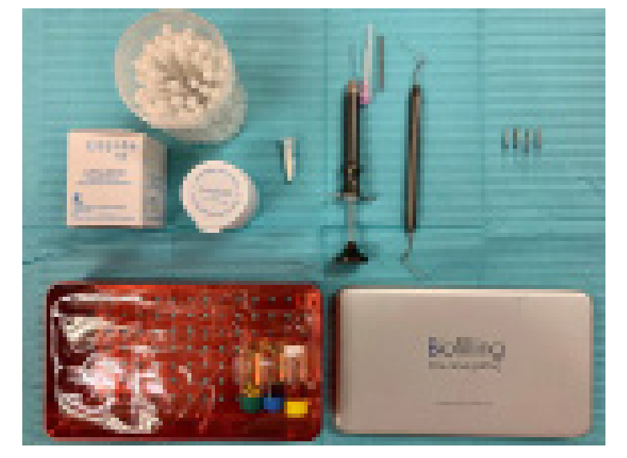
Figure 5 Biomaterial intracanal grafting kit including OrthoMTA, gun, compactors and plugger.

The patient was recalled after oneweek, old temporary dressing was removed, canal was irrigated with 5 ml of 3% NaOCl (Coltene/Whaledent, GnbH, USA), saline and 17% ethvlenediaminetetraacetic acid (EDTA) (PULPDENT, Watertown, MA, USA) each for 1 minute ensuring no extrusion of any irrigating solution. The mastercone radiograph was taken to reconfirm the extension of root canal filling material. OrthoMTA (BioMTA, Seoul, Republic of Korea, Figure 5) was mixed according to the manufacturer's instruction and placed in the canal using the MTA gun. The compactor with the established working length was used to place OrthoMTA (BioM-TA, Seoul, Republic of Korea) upto the working length of the root canal following the manufacturer's instruction. The hand plugger was used to compact OrthoMTA (BioMTA, Seoul, Republic of Korea) in the canal with the controlled working length. The excess OrthoMTA (BioMTA, Seoul, Republic of Korea) was removed from the canal orifice area and a damped cotton pel-