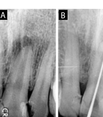
Figure 6 A) Preoperative intra-oral radiogrpah showing open apex on tooth 11 with large peri-apical radiolucency and coronal radiolucency on tooth 12. B) Establishing the working length. C) Obturation done using OrthoMTA. D) Three months follow up showing satisfactory periapical healing and closure of root apex, (E) Thirty months follow up radiograph tooth 12 showing complete resolution of peri-apical lesion.

After obtaining the written consent, the treatment was carried out. The area was anesthetised using 2% lignocaine with epinephrine 1:200,000 (inibsa, Barcelona, Spain) and an access cavity was prepared under rubber dam isolation. The working length